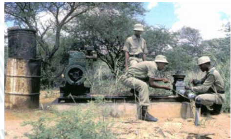
Pumping System at the Khama Rhino Sanctuary in Botswana